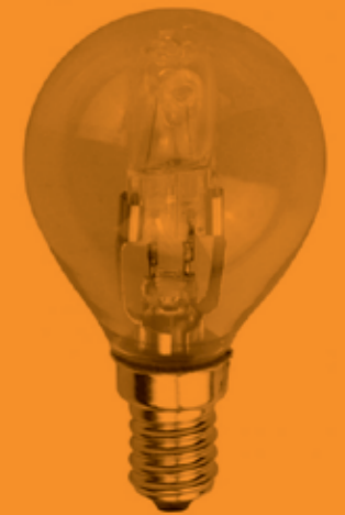
Electrical Installation and Project Work