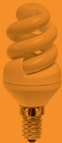
Electrical Repairs and Maintenance