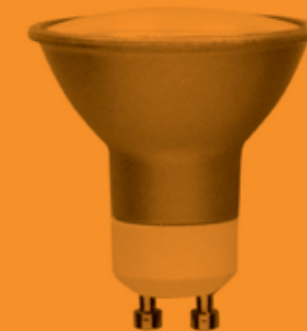
24 Hour Call Out Service