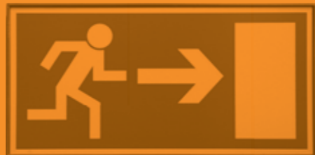
Fire Alarm and Emergency Lighting Installation, Maintenance and Testing