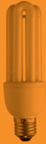
Electrical Installation Condition Reports (Periodic Testing)