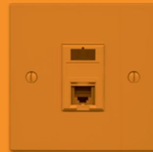
Data Network Cabling and Containment